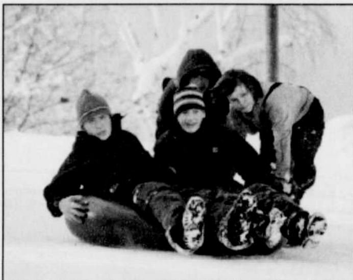
Heppner students enjoyed their snow days on Monday and Tuesday with a lot of sledding.