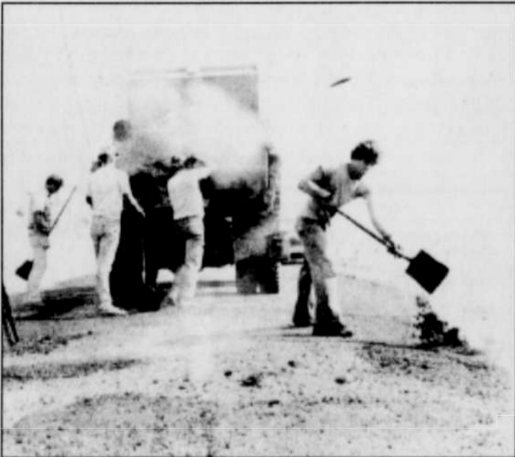
September 5, 2007 - In 1980 local farmers worked to patch Sand Hollow Road. Currently road crews are working to repair the road.