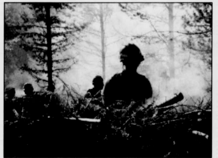
October 31, 2007 - Students attending the Umatilla National Forest Fire and Fuels Orientation Camp performed many tasks during their week long camp. Among those was a prescribed burn in which non-commercial thinning was piled up and burned.