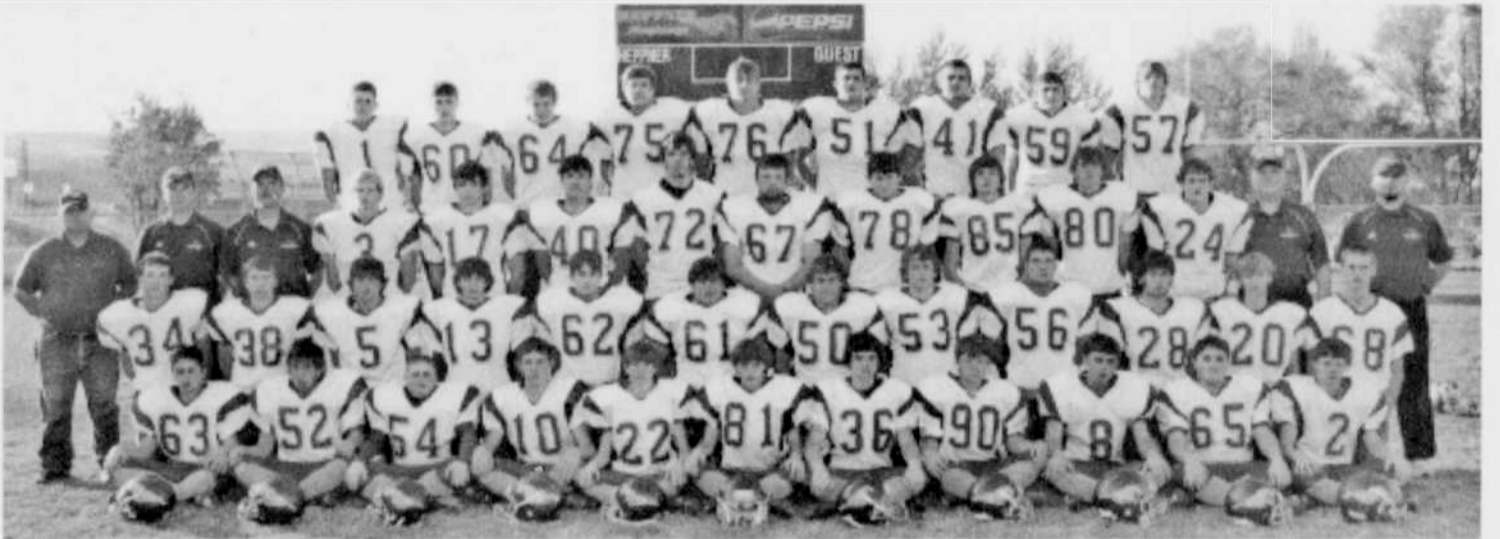
December 5, 2007 - The Heppner Mustangs took second in state this past weekend. The Mustangs lost their bid for state champions by a score of 10-6 to Culver. The Mustangs ended their season with an impressive 10-3 record.