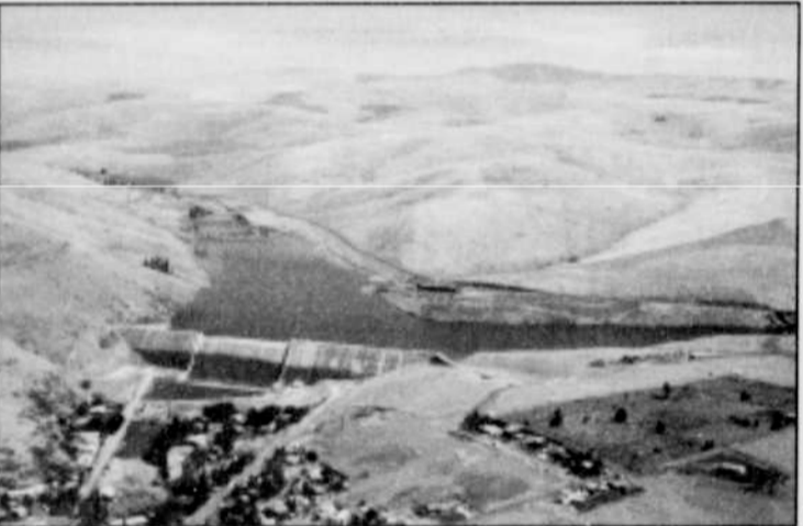
November 7, 2007 - Corps of Engineers plans to give long-term irrigation contracts for Willow Creek Lake water.