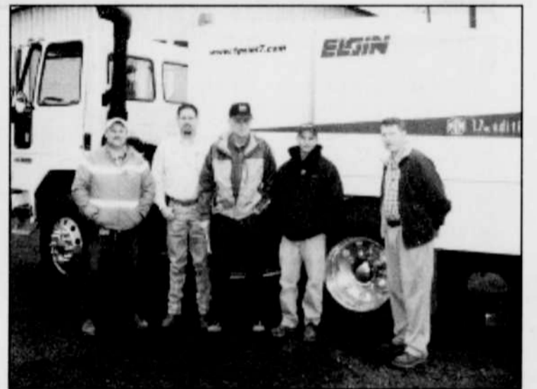
October 10, 2007 - Miller & Sons Excavating purchased Heppner Garbage Disposal.