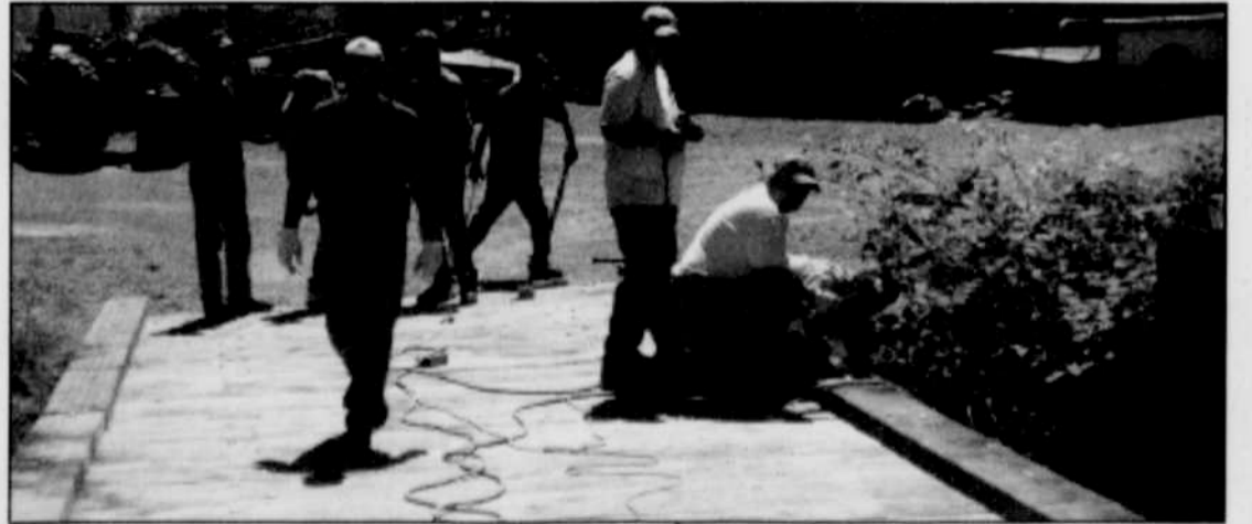
July 4, 2007 - Kirk Street Bridge was in bad need of repairs. Neighbors and the city crew stripped off the old timbers on Sunday and put on a brand new surface on Monday.