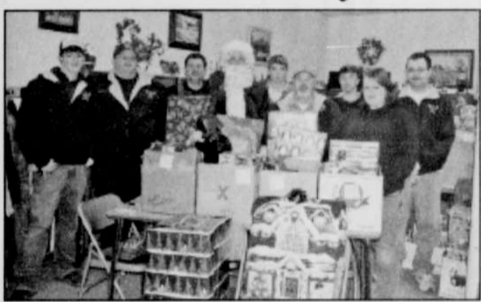
Santa, with his helpers from the Heppner Volunteer Fire Dept., delivered gift boxes from the South Morrow County Neighborhood Center to families on Wednesday, Dec. 19.