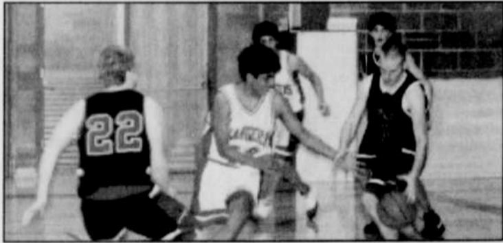
An Ione player tries to get past Dufur's defense.

The Ione Boys' JV team watched a halftime tie erode in the second half, losing to Dufur on the road on Saturday, December 15, 32-43.