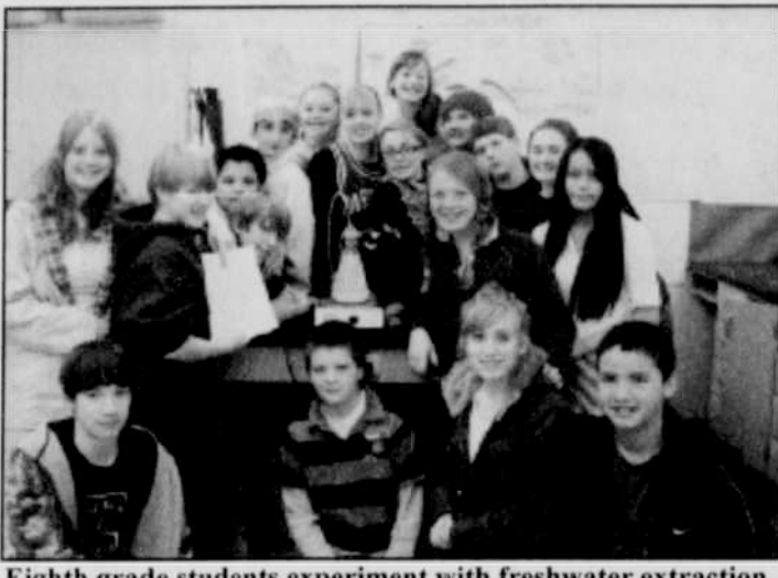
Eighth grade students experiment with freshwater extraction from salt water during an oceanography unit.