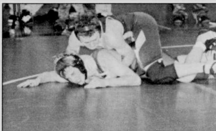
The Mustang's wrestling season got off to a start with Heppner participating in their first match of the season at Mac Hi.