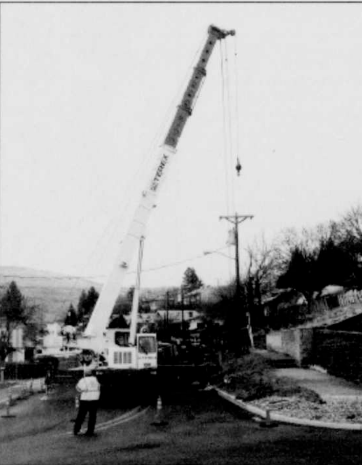
Court Street was blocked off for a few hours on Tuesday, November 27, as workers used a crane for prep work needed for road expansion that will begin in 2009.