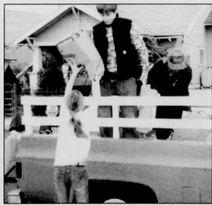
Students help load donated canned food items into a pickup truck.