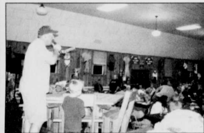
The Ione Education Foundation fundraiser was a grand success on Saturday, September 22. The fundraiser included a dinner, auction and raffle. Gross proceeds for the event were $28,000.