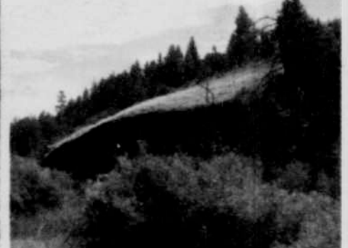
2 creeks on the property