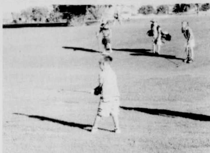
Children enjoyed a day of fun and learning at the Junior golf clinic held at the Willow Creek Country Club.