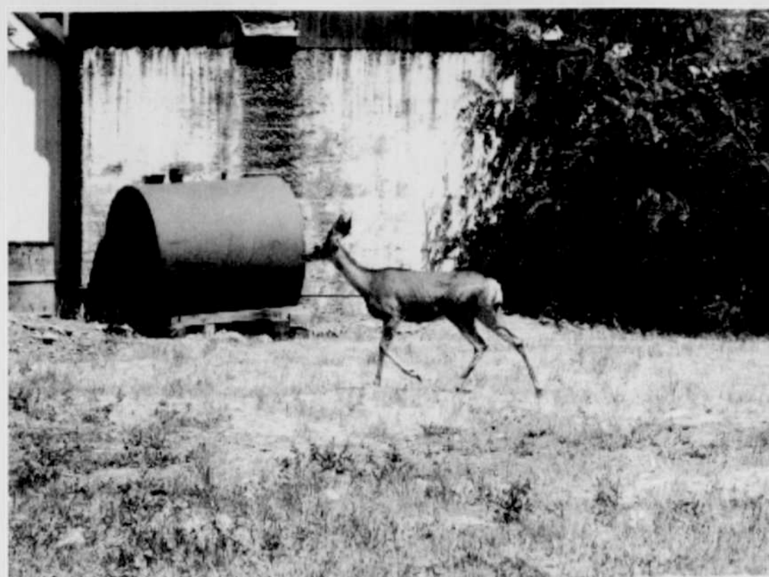
This deer ventured into the empty lot on West Willow Street in Heppner to assert its independence on July 4.