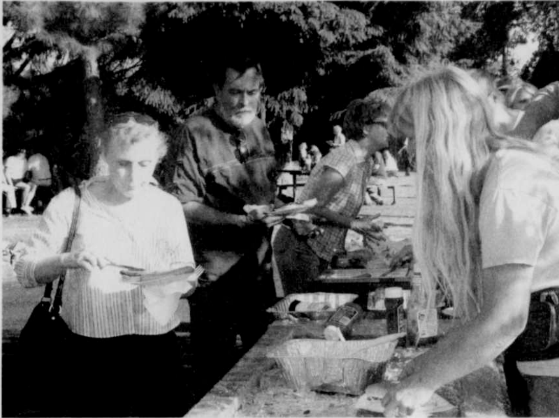
Picnickers enjoy the BEO barbecue at the Heppner City Park.

BEO Bancorp is the holding company for Bank of Eastern Oregon, which operates 11 branches and three loan production offices in nine eastern Oregon counties. Branches are in Arlington, Ione, Heppner, Condon, Irrigon, Boardman, Burns, John Day, Prairie City, Fossil and Moro; loan production offices are in Hermiston, Ontario and Enterprise.