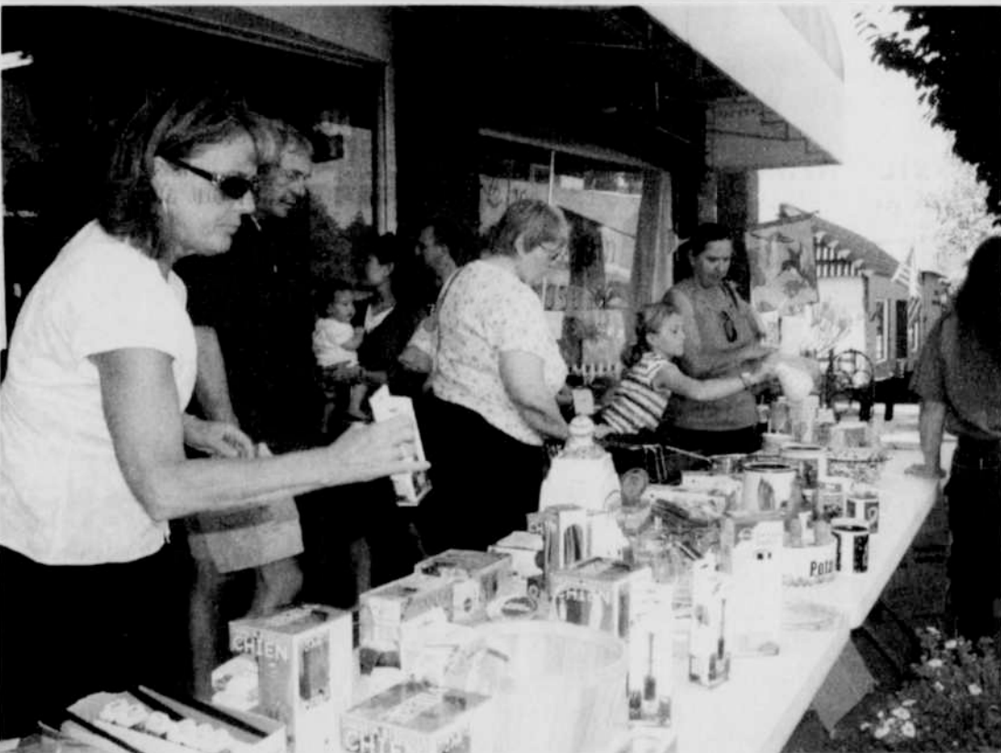
Shoppers peruse the bargains at the downtown merchants' sidewalk sale Friday.