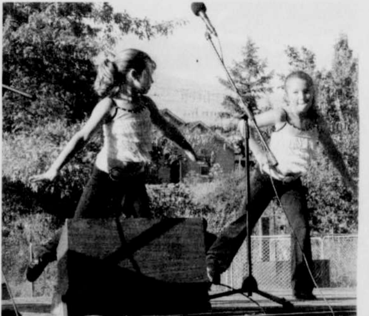
Two young performers entertain the crowd during the talent show held at the city park.