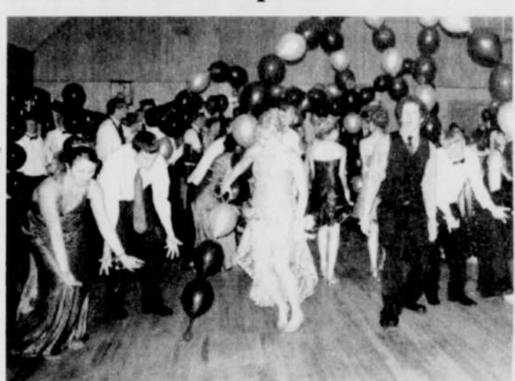
Students from Ione High School enjoy their prom

Ione High School hosted its prom on Saturday, April 21. The theme of the prom was Casino Royale 007. The junior class sponsored the event, and held it at the Ione Grange Hall.