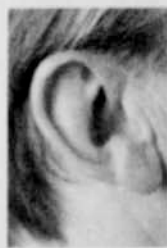
Can you see it?

Please join us for our OPEN HOUSE and receive a complimentary HEARING TEST just for attending.