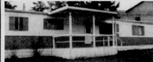
1979 Single Wide With Expando