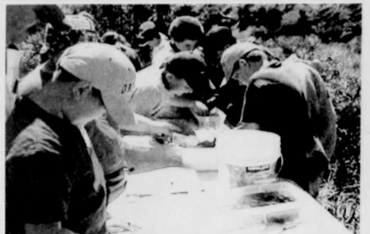
Students identify macro-invertebrates from Willow Creek.