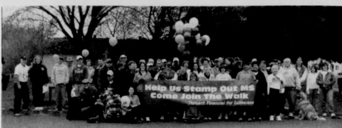
Pictured are the participants for the 2007 MS Walk