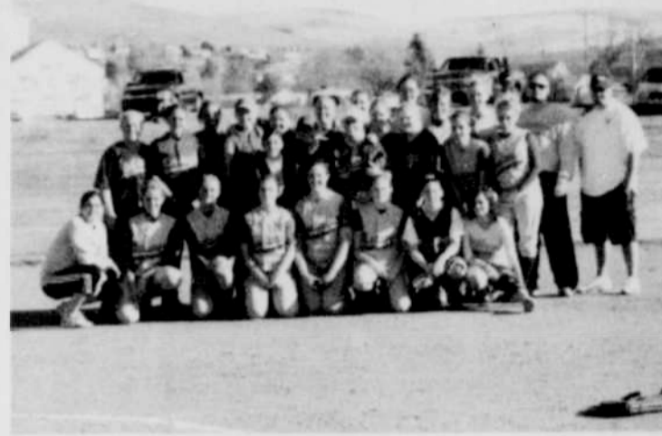
The Heppner Mustang Softball team began their year playing against Heppner's Alumni Team. The Alumni took the win by one.