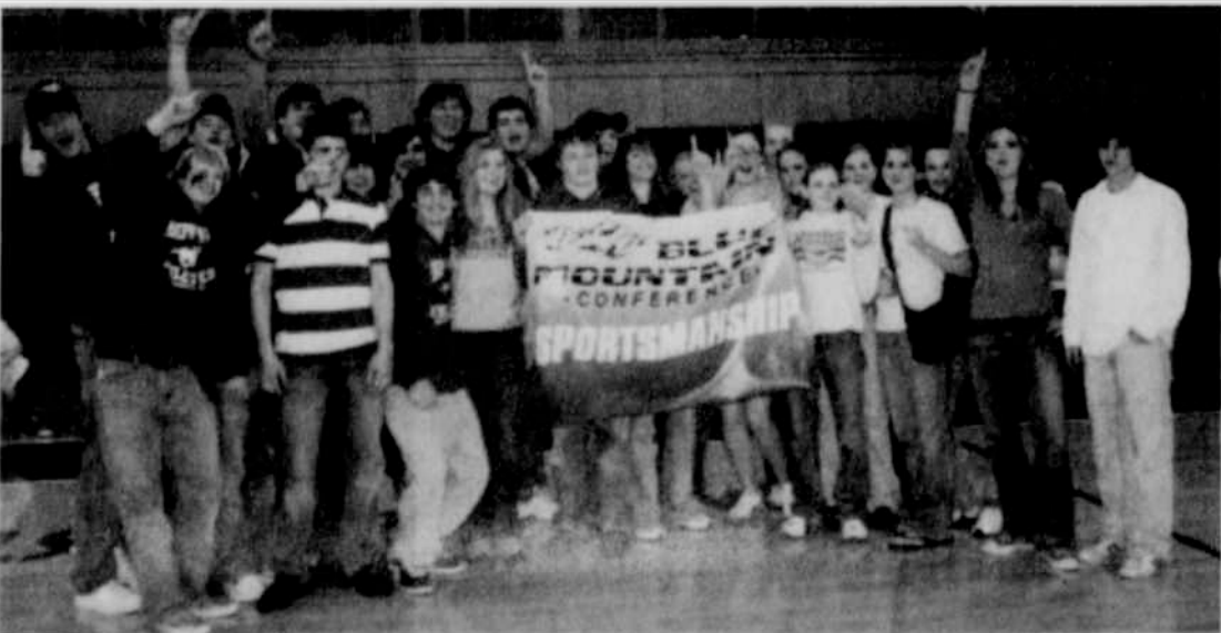
The Heppner Mustang Boys and Girls won the All-Conference Sportsman Ship award for the 2007-year.