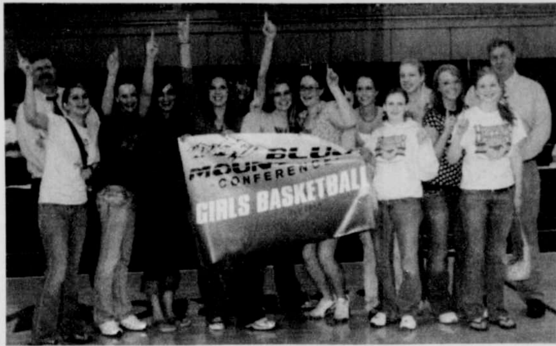
Heppner High School girls' basketball team, Blue Mountain Conference winners.