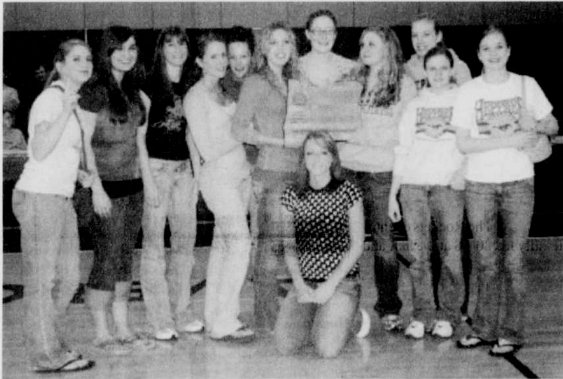
Heppner High School girls' team, league winners.