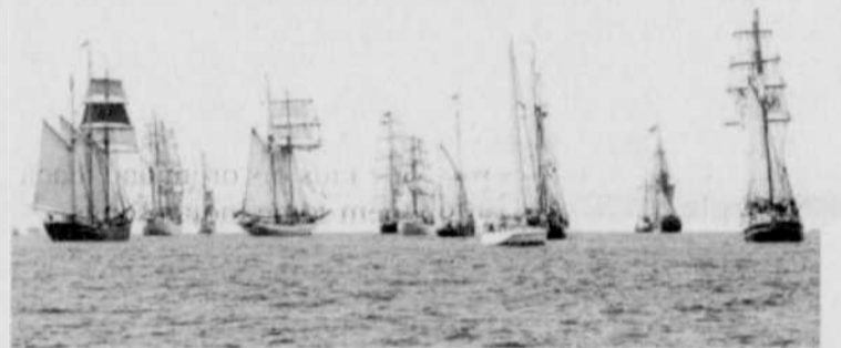
Hanse Sail Christmas fair

Every year at the beginning of August the Hanse town of Rostock celebrates the festival of Tall Ships, the Hanse Sail Rostock. Impressive windjammers, traditional sailing ships and museum ships will provide a unique maritime flair in the old town port at Rostock and in Warnemuende, with sailing trips available for visitors, too. The biggest and most colorful sailing festival on the Baltic coast attracts more than a million visitors each year.