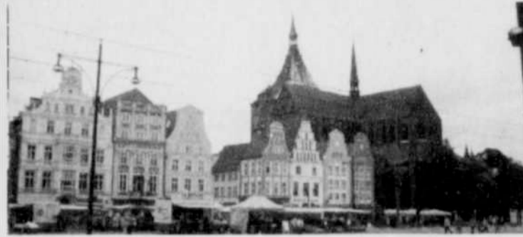
St. Marie's Church

Building started mid-13th century, but in 1398 the nearly finished building collapsed. After that a cross-shaped Basilica emerged, built in the style of the French cathedral style and the St. Marie's Church in Luebeck. Its tower is Baroque. The art treasures of the Marienkirche are worth seeing including the astronomical clock built in 1472, the bronze baptismal font consecrated in 1290, the Rochus altar from around 1530 and the Baroque organ.