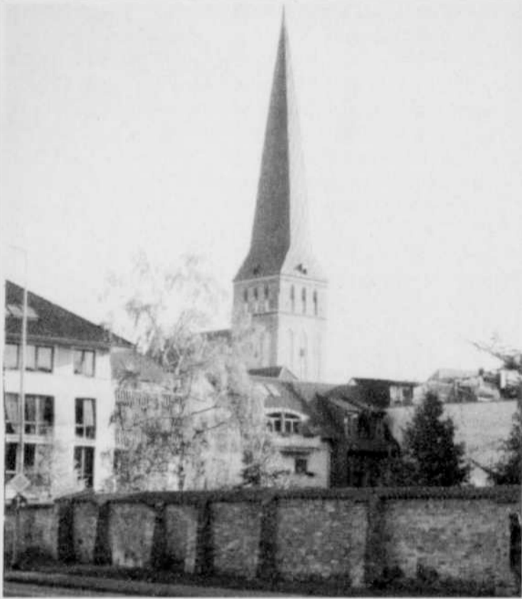
St. Peter's Church and parts of the reconstructed City Wall Town Hall

With its 355-foot spire topping the city skyline, the Petrikirche marks the area where the town was founded. The church was first mentioned in 1252 and is at least 800 years old. Interestingly, it was built with some breaks. For instance, in 1311 when Rostock was at war with the Danish king, the townspeople took some of the church's stones to build a defense tower on the Baltic in Warnemuende. From the viewing guests can look out over the entire city, along the Warnow River up to Warnemuende and the Baltic.