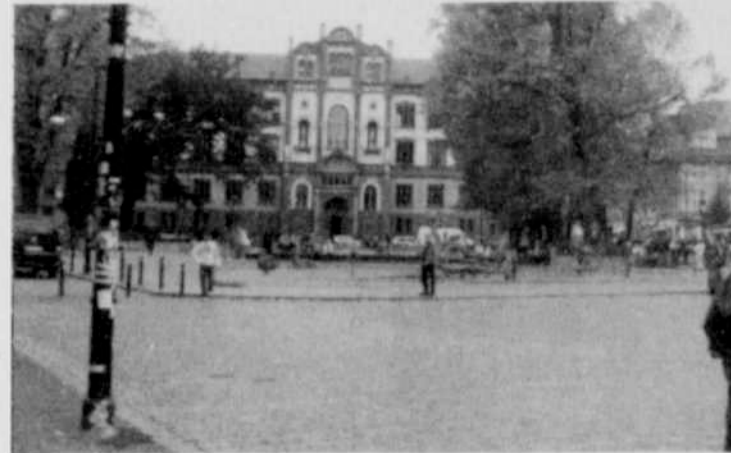
University - Main Building Warnemuende

environmental sciences, engineering, mathematics and natural sciences just as economic and social sciences. In these faculties study more than 12000 young people from around the world.