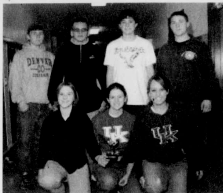
The Ione Speech and Debate team

The Ione Speech and Debate team traveled to Tualatin this past weekend for their third tournament of the season. They left Ione at noon on Friday and arrived at Tualatin High School to begin competition at four o'clock. Upon arrival, Ione discovered that they would be competing against 25 other teams – all from 5A and 6A schools.