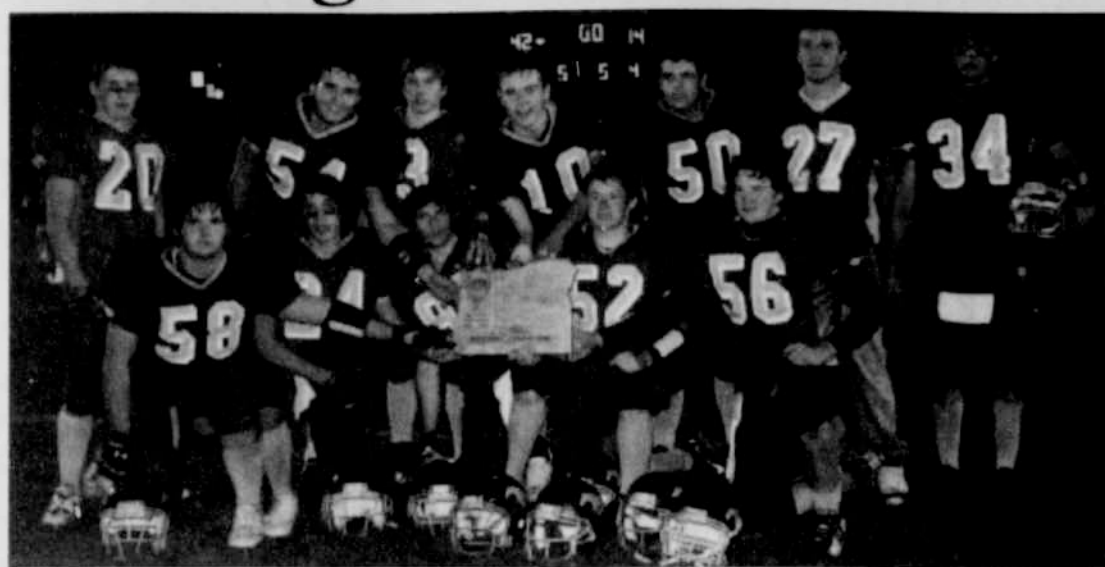
Heppner Mustang senior players and their first-place district plaque.