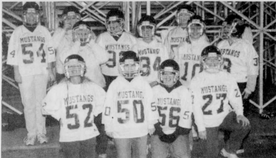
Senior players' mothers entertained the crowd during half time of the Mustang football game.