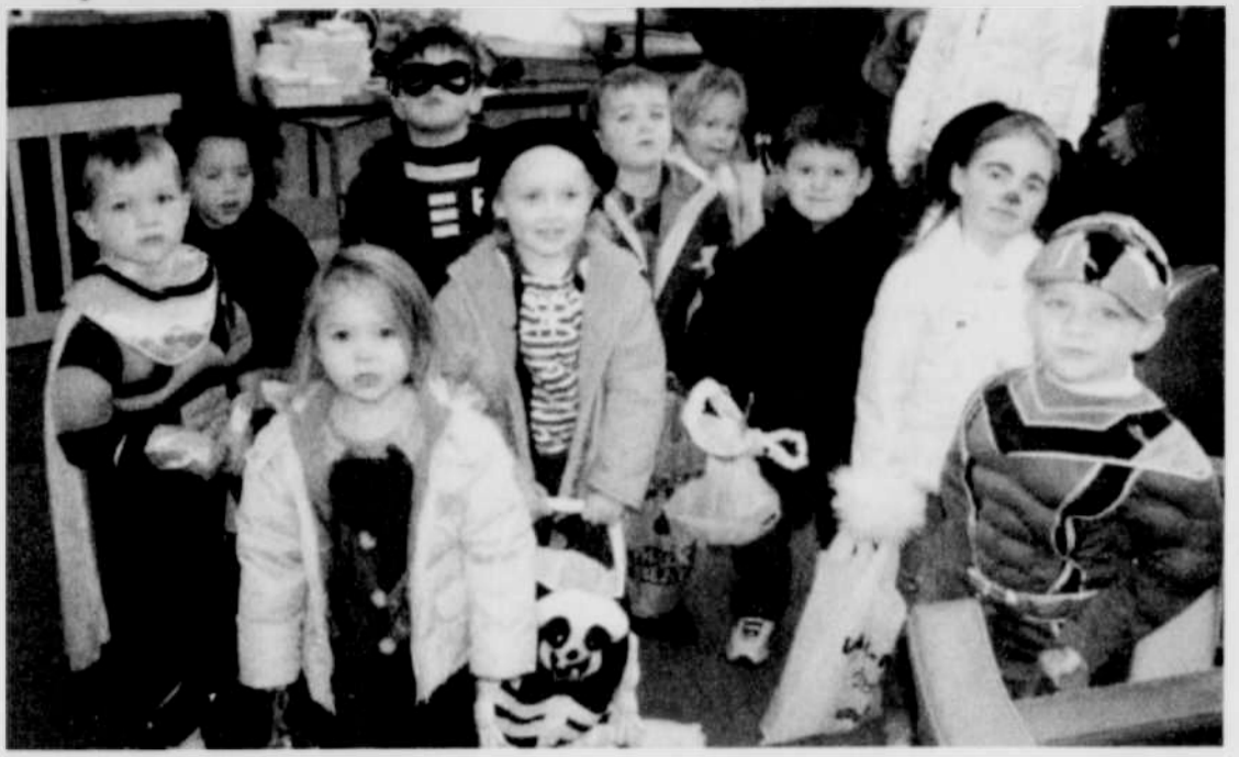
Heppner Day Care kids got an early start on Trick-or-Treating on Halloween, by visiting local businesses, including the Gazette-Times.