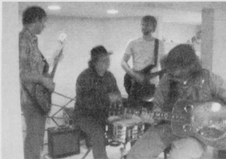
The Beatnik Blues Band