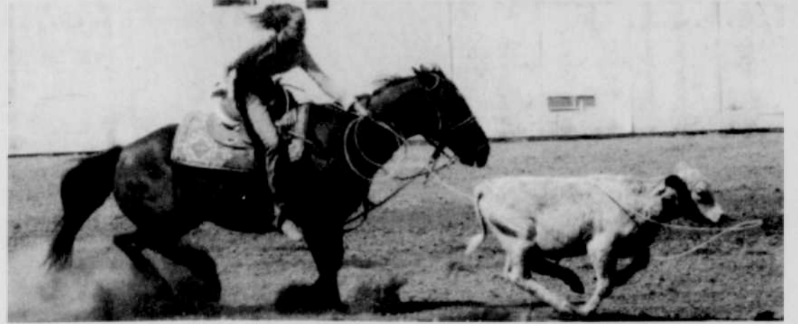
Taighler Dougherty took first place in breakaway roping.