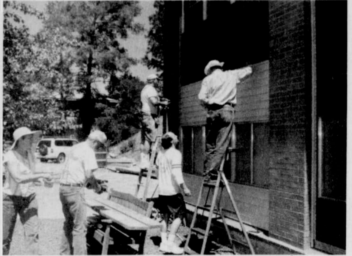
Volunteers put up siding at the Heppner Nazarene Church