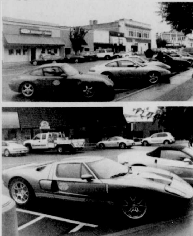
Cruise the Blues car club from Hood River, filled with Porphes and Corvettes, as well as other interesting vehicles, visited Heppner on Friday, June 2.