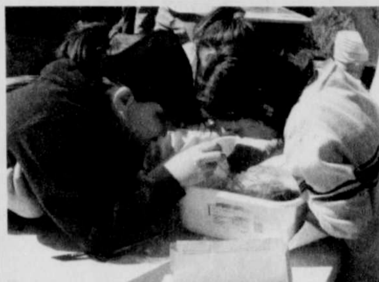
Students study Macro-invertebrates