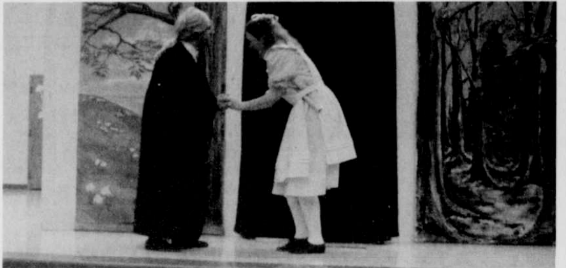
Two actors from the Hampstead Players enact Alice in Wonderland at HES.

Often dreams are more vivid than real life. Students from Heppner Elementary School, Headstart and Heppner Daycare experienced Alice's dreams in the production of "Alice In Wonderland" by Lewis Carroll performed for them on April 18. Students were invited to participate in "The Mad Tea Party" and "The Queens' Croquet-Ground." The Hampstead Players travel from New Hampshire to tour the country. Two actors set up and perform the entire play.