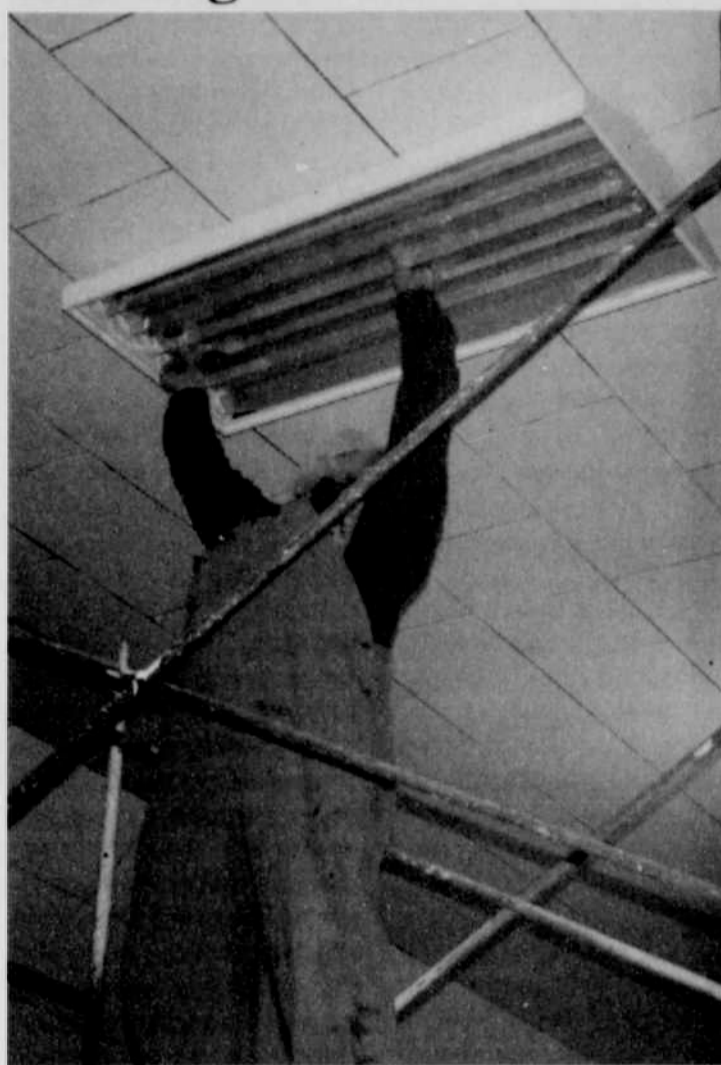
Loyal Burns installs new light fixtures after the paint dries.