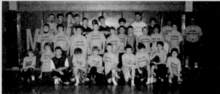
Colt wrestling team, along with HHS wrestlers and coaches.