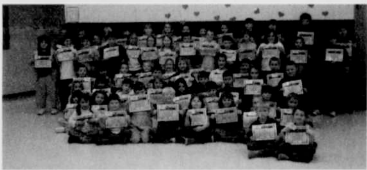
Students making honor roll received certificates for their work.

Heppner Elementary School announced its second quarter honor roll during a school assembly. The students making honor roll received certificates.