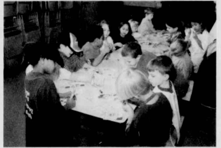
While waiting for their painted ducks to dry, Camp 5's younger group decorates notes to put in the clothespin bills.