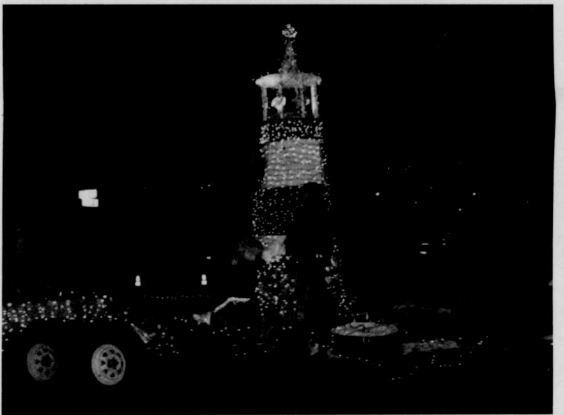
One of the entries in the Light Parade

The winners of the 2005 Light Parade contest have been announced. They are as follows: