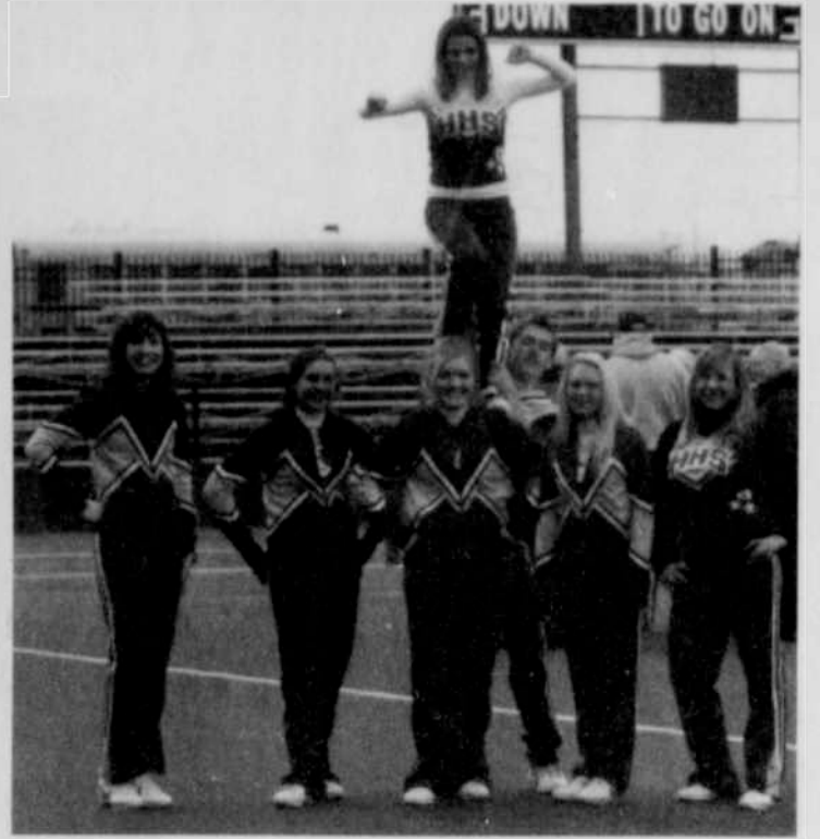
The Mustang Cheerleaders tried to keep the spirit high in Hillsboro

There will be no Heppner Little League meeting in December. The next meeting will be January 19, 7 p.m. at the Pettyjohn Building.