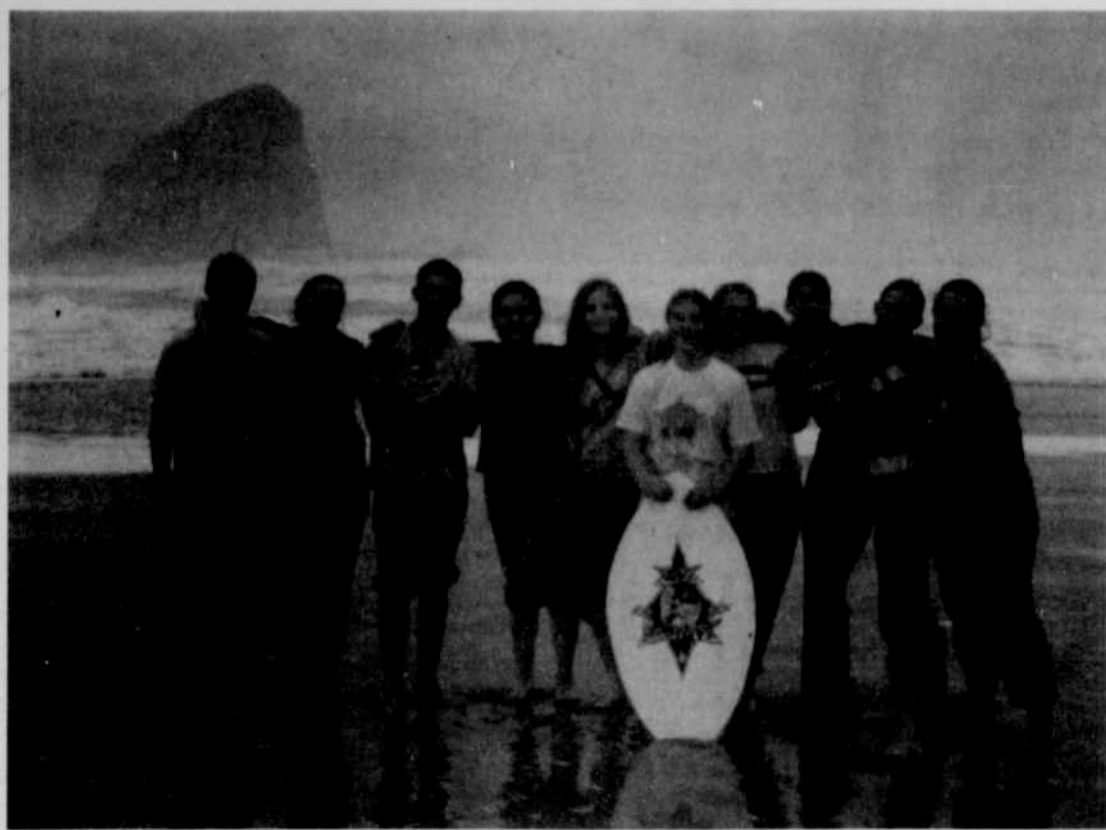
Ione students enjoy the ocean