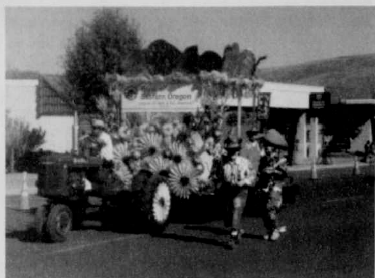
The Bank of Eastern Oregon took best commercial float.