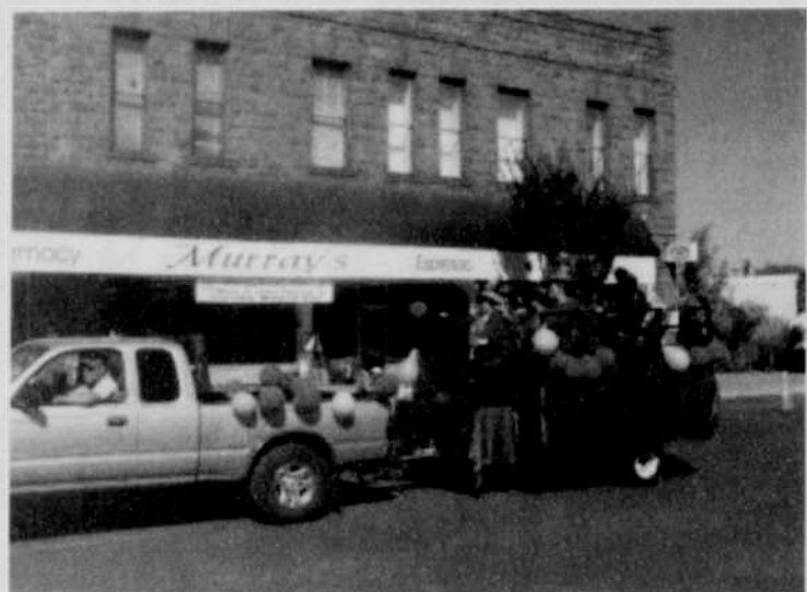
The Camas Prairie Red Hat Mamas took best community float.

The 2005 Morrow County Fair and Oregon Trail Rodeo parade was held Saturday, Aug. 20. The theme for this year's fair was "From the River to the Mountains."