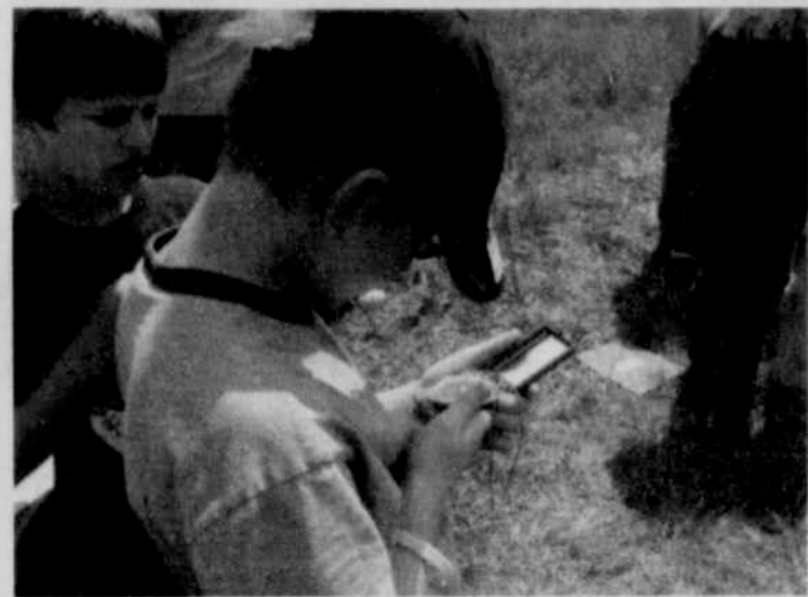
Students practice with compasses at the mapping station during the annual Watershed Field Day.