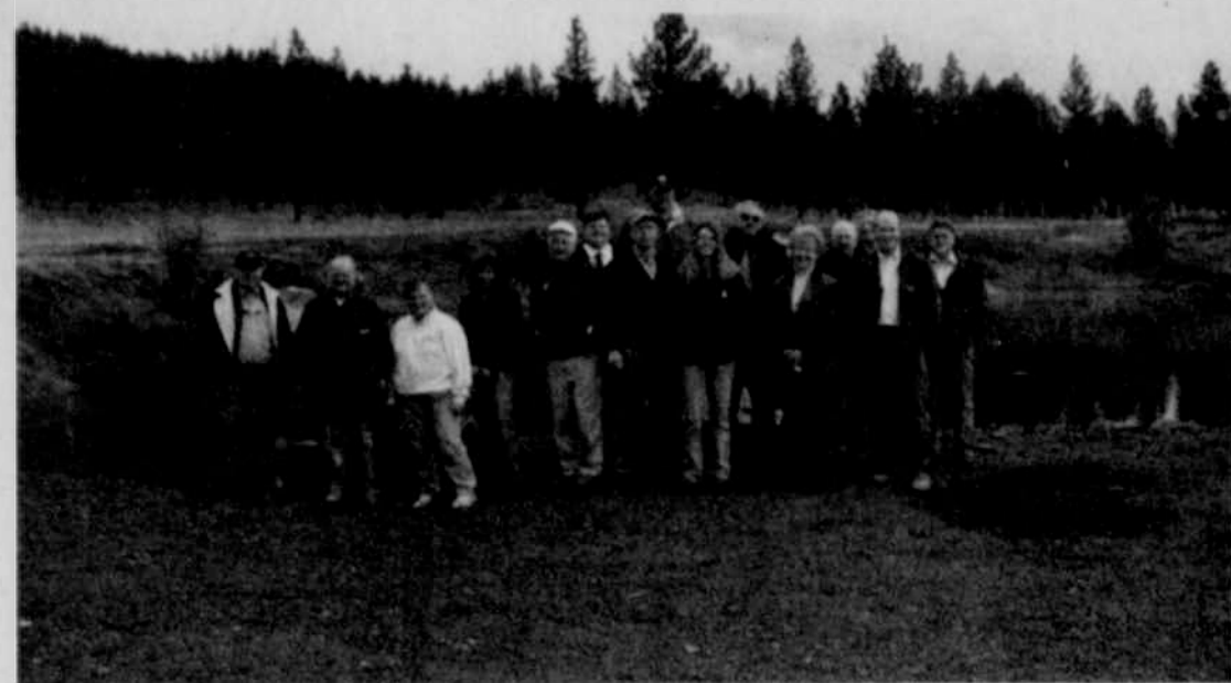
Members of the Oregon State Parks Commission, Oregon Parks and Recreation Department, ATV Allocation Committee and Morrow County staff toured the OHV park last Thursday, April 21 after a meeting of the OSPSC held in Heppner.