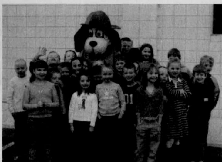
HES students enjoy a visit from Sparky the Fire Dog, who helped teach the lessons of fire safety.

Students at Heppner Elementary School were visited by the state fire marshal on Wednesday, April 13. The group brought their fire model trailer, which had smoke machines, fire