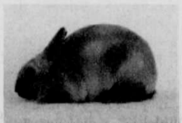
Best of Variety Tort winner KT's Annie Oakley