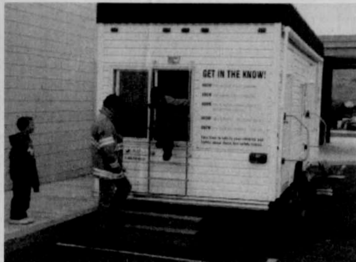
HES students practice emergency evacuation during a fire with the aid of the state fire marshal's fire model trailer.