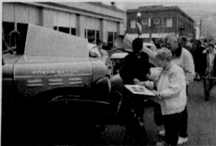
Spectators look over the Dodge Powerwagon at the Cruz-In

The fifth annual St. Patrick's Celebration Cruz-In included 52 entries under cloudy, windy, wet weather.