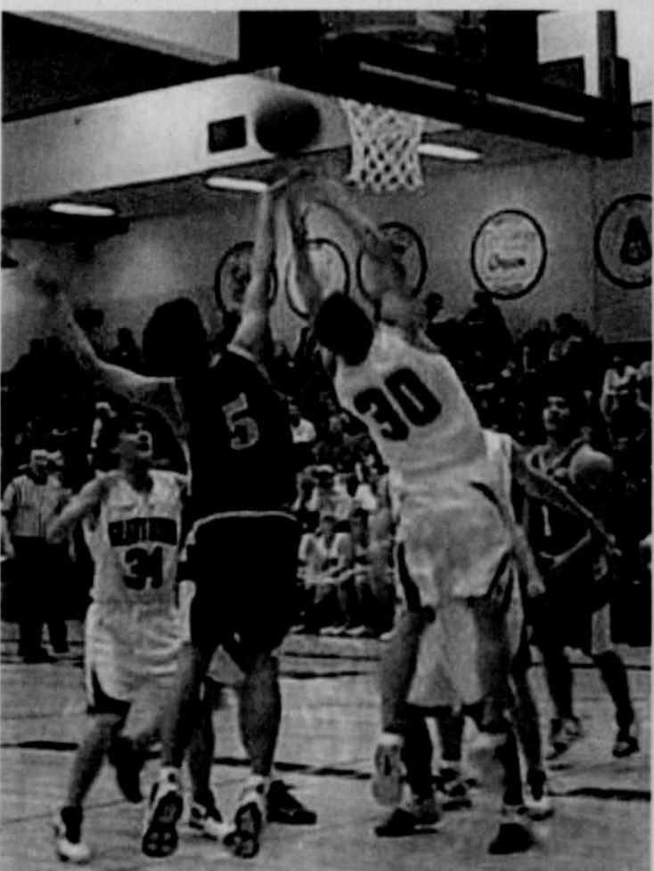
Mustang goes up for a shot