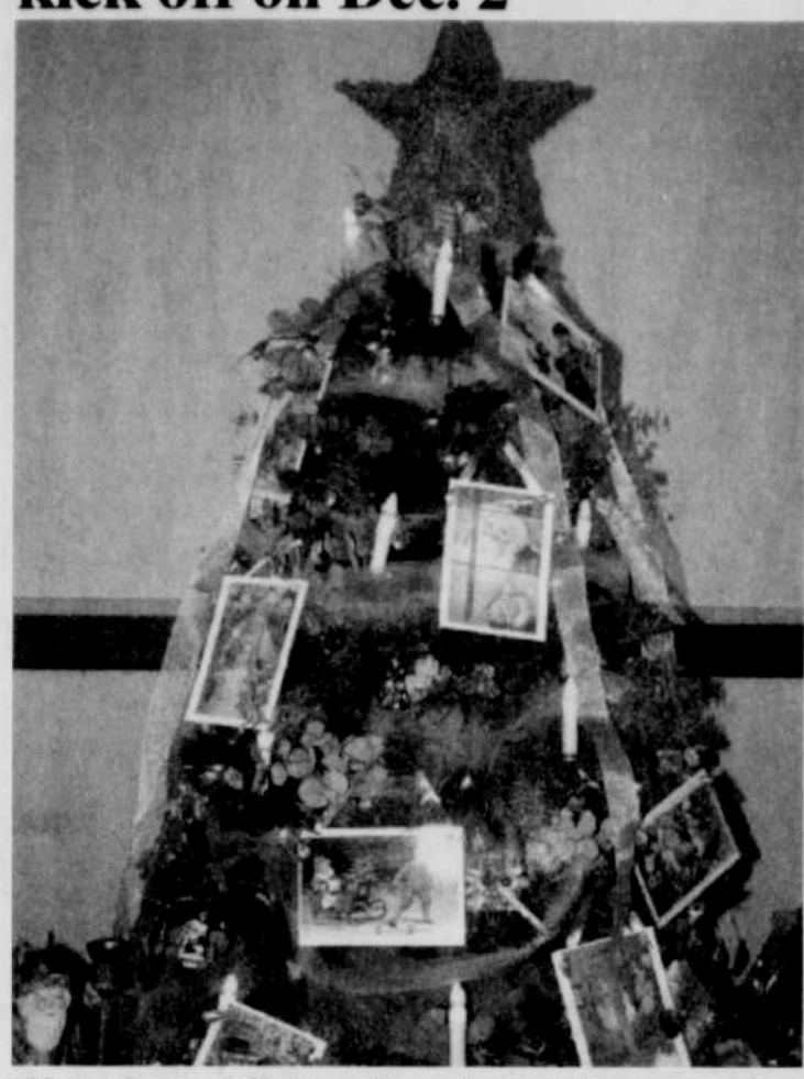
"Picture Postcard Christmas" tree, just one of the many unique creations for the Chamber/Hospice Christmas Tree Auction.

It's beginning to look a lot like Christmas in Christmas" sponsored by Heppner's new City Hall. Sherrell Insurance. They have graciously hold the third annual Larsen Christmas Tree Auction