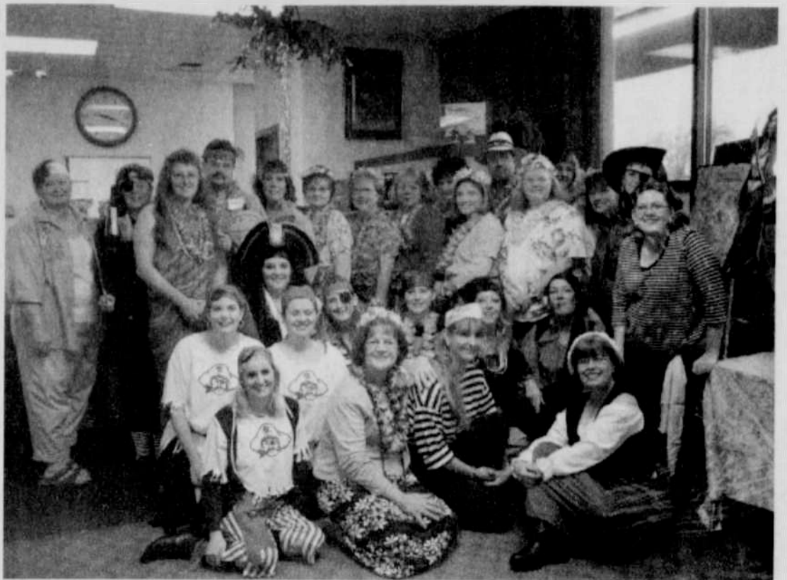
Bank of Eastern Oregon employees dressed up on Friday, Oct. 29 to celebrate Halloween.