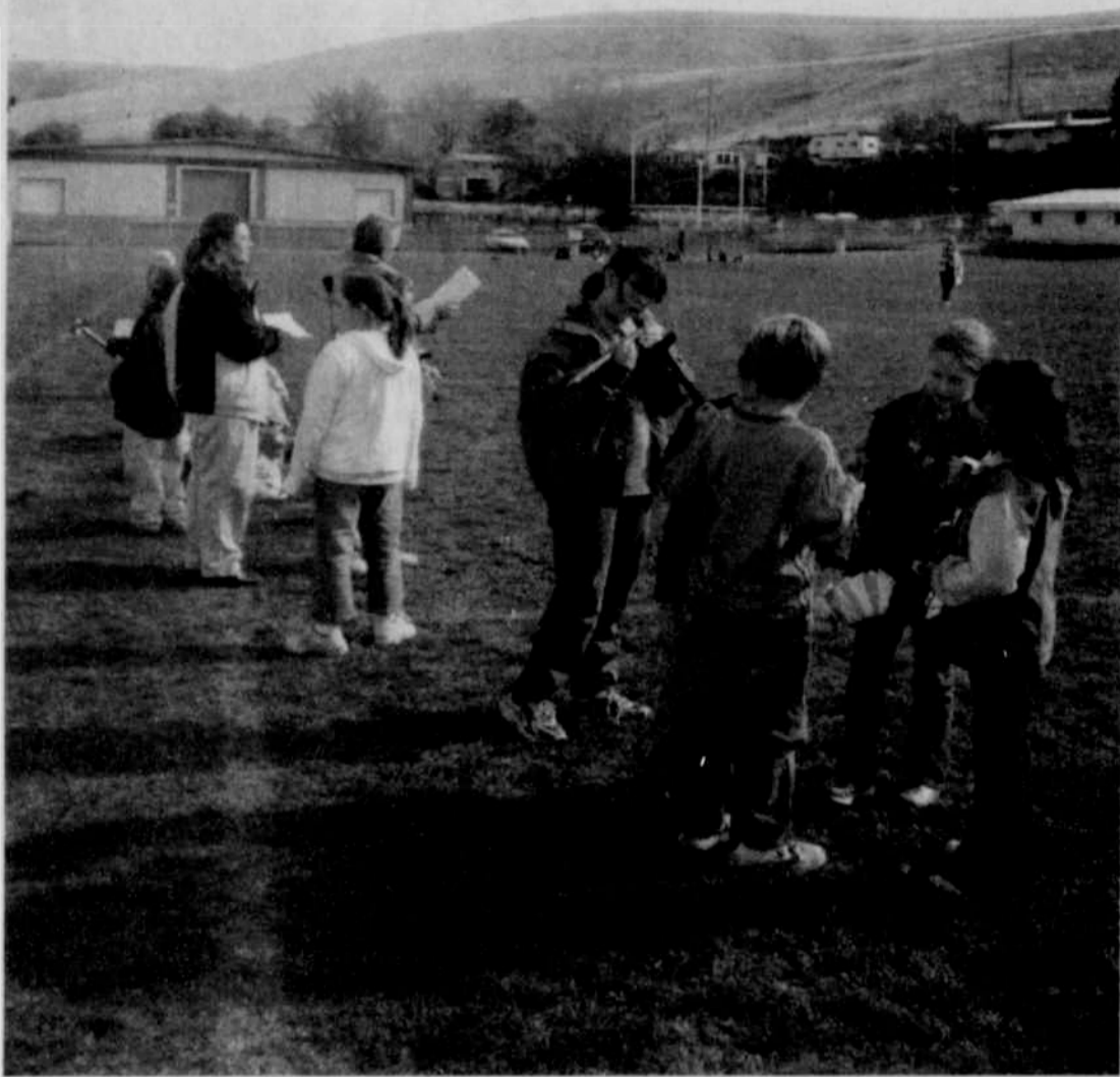
Students at Heppner Elementary School spent Monday afternoon shooting off the rockets they had created. Once the rockets shot into the air, tiny parachutes popped out to guide the rocket safety back to the ground.