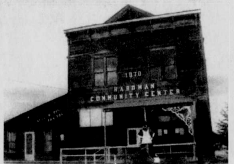
The Hardman Community Center

Hardman Community Center members are anticipating serving their annual Oyster, Salmon and Ham Dinner to more than 400 hungry hunters and visitors on Saturday, Oct. 2.