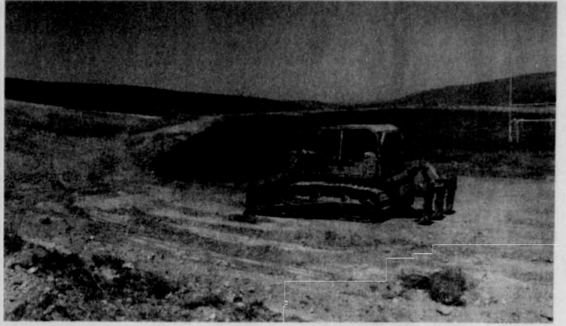
Earlier this summer the Heppner High School track was torn up for improvements

After many years of being passed by for improvements, the Heppner High School track has finally received its turn. For years the track has been crushed gravel. Then the Lions Club installed a curb around it, but other than general upkeep no improvements had been made.