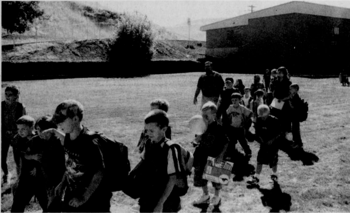
Students at HES depart to the buses after the first day of school on Aug. 30.