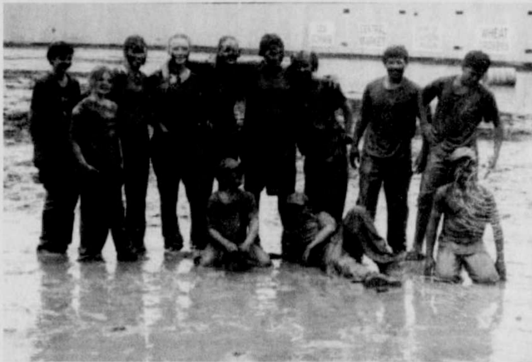
Children of the Fair and Rodeo volunteers turned a rainy day into fun by "mud wrestling" in the rodeo arena. All the kids were covered from head to toe.