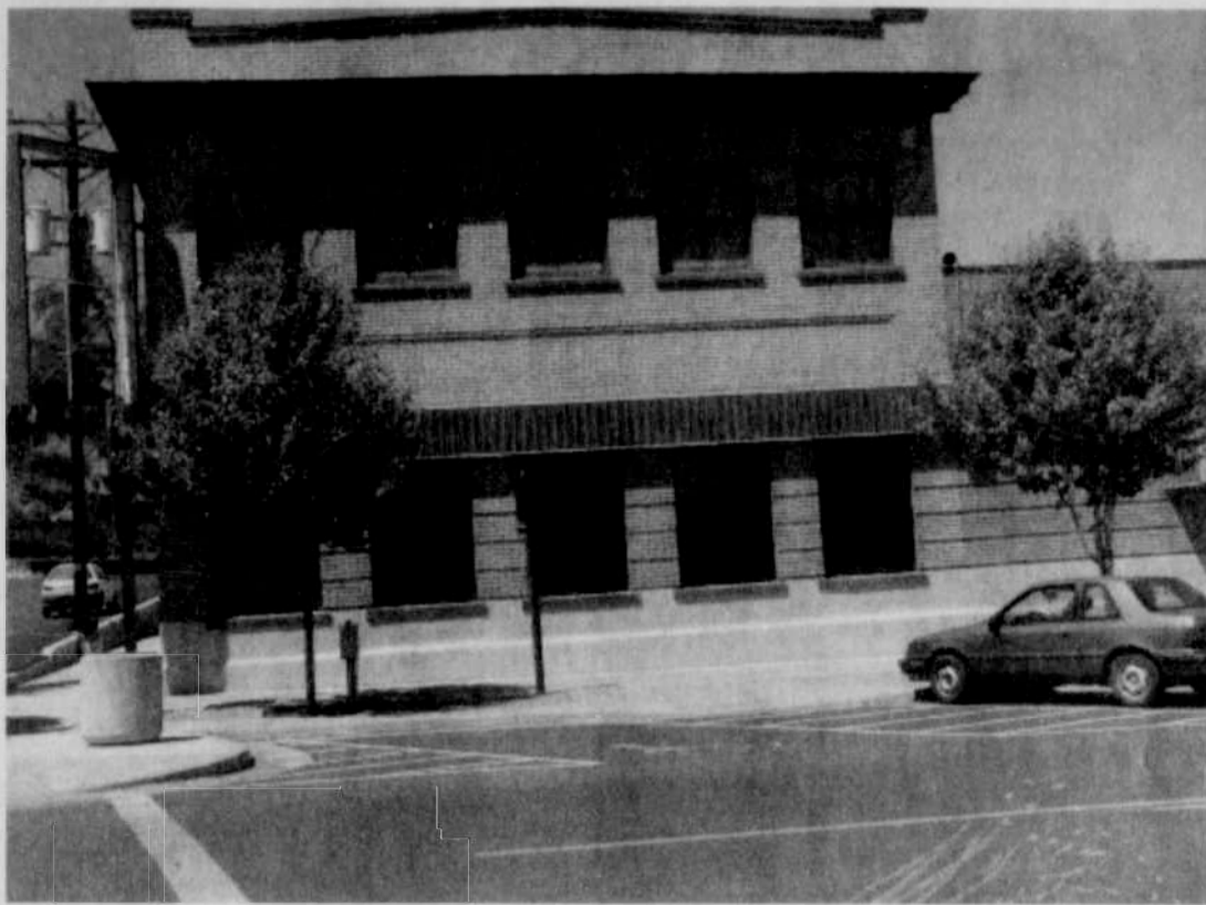
The city council Monday gave the final okay for purchase of the Klamath First Bank building. The building will be used for the new city hall residence

The City of Heppner voted Monday to finalize the purchase the former Klamath First Bank building for use as a new city hall.