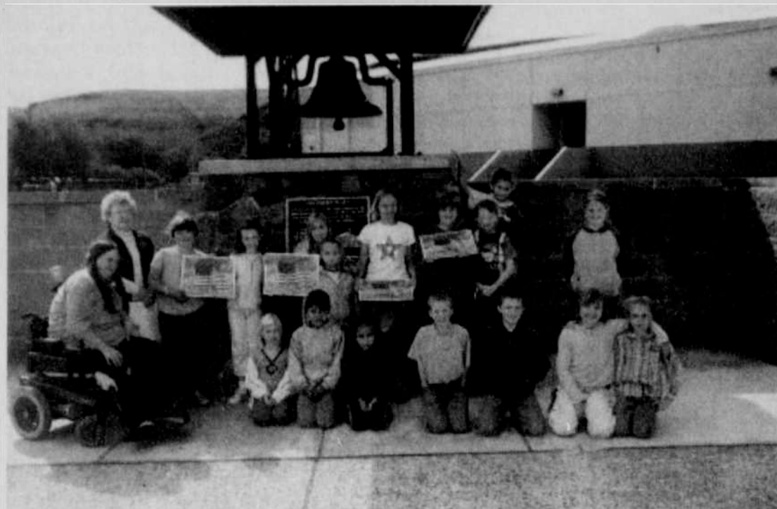
Representatives from the Ione American Legion auxiliary donated American flag puzzles to students in grades K-4 at Ione Elementary School.

The Ione American Legion Auxiliary members teamed up with the Ione K-4 grade students for a coloring display along with the distribution of poppies leading up to the annual